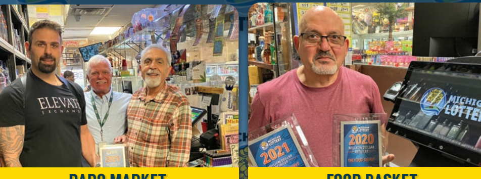
On North Saginaw Street in Flir