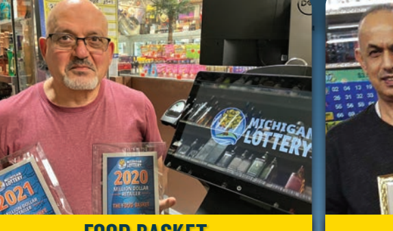
On Eureka Road in Taylor